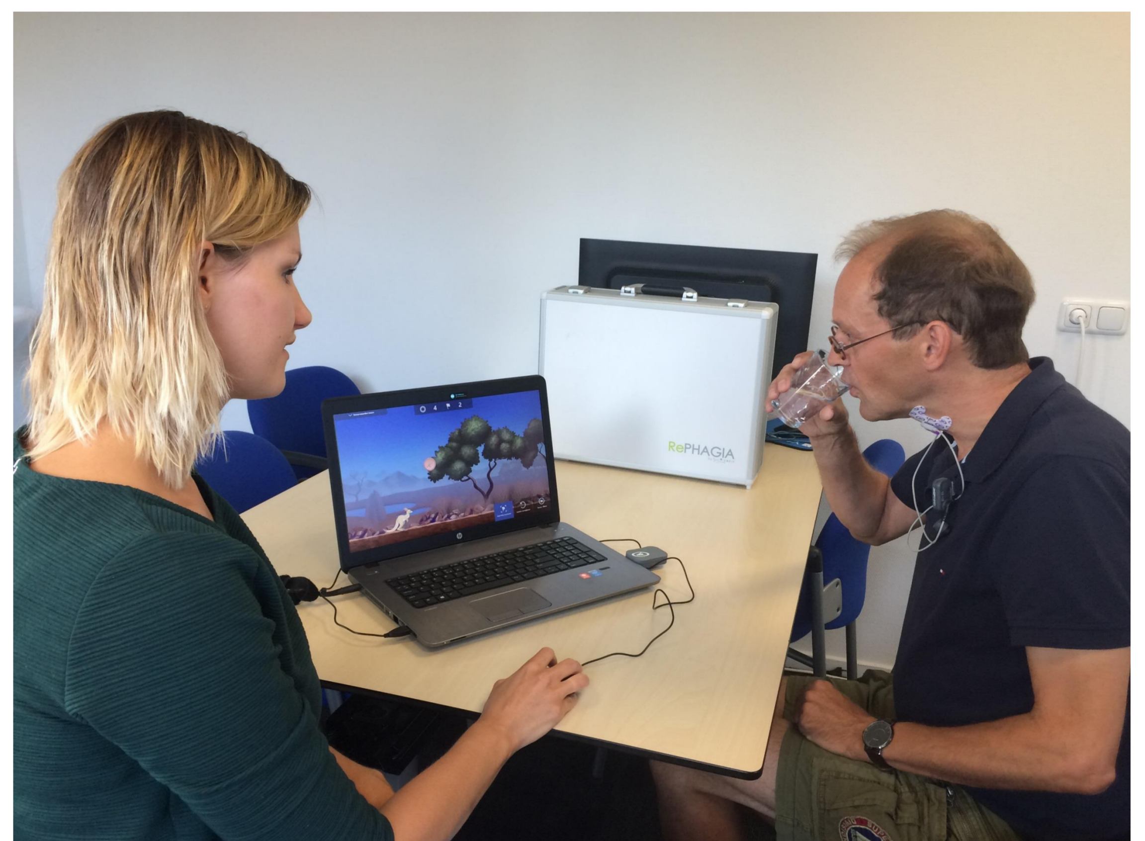
Figure 1. Practicing with SilverFit Rephagia

Patient: "I think it's fun and educational, because I can see what happens."